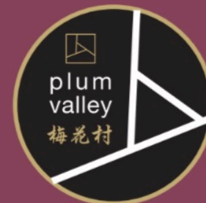
Plate Rice /Noodles Menu